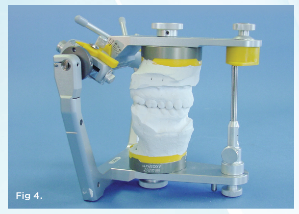
Fig 3. Gathering data using a dentofacial analyzer to mount upper model on an analog articulator. Fig 4. Mounting models on an analog articulator.

found that their device had sub-millimeter control.