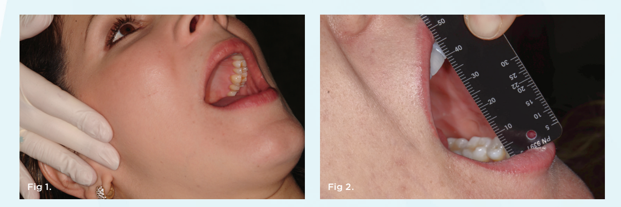
Fig 1. Palpating the patient for joint sounds indicating TMJ changes. Fig 2. Measuring the maximum opening distance to assess patient's jaw range of motion.

coming. They also noted that studies have analyzed the use of ultrasound for TMD injection guidance, internal derangements detection, and assessment of increased capsular width. Greater frequencies may be necessary to improve the accuracy and sensitivity of ultrasound for dental purposes.<sup>3</sup> Overall, however, oral cavity soft-tissue imaging is increasingly becoming a "simpler" reality. Devices are being introduced that provide ultrasound probes designed for the oral environment, and new visualization systems are being used to guide new users in diagnostics.